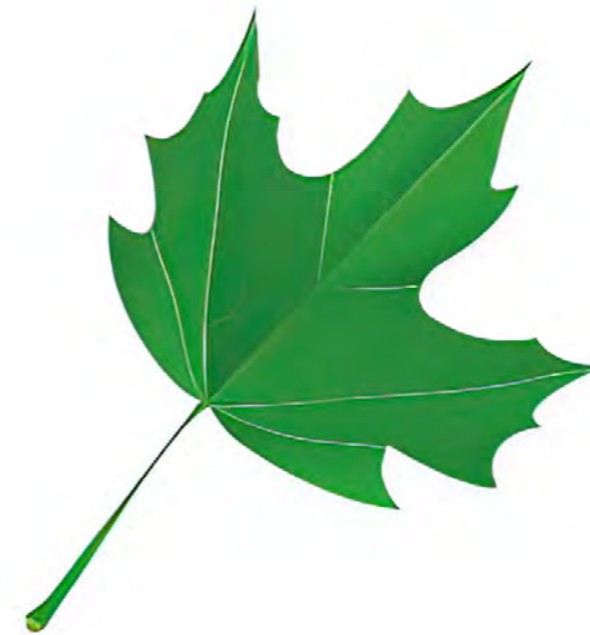
1. Ninaatig (Nin-naw-tick) Sugar Maple