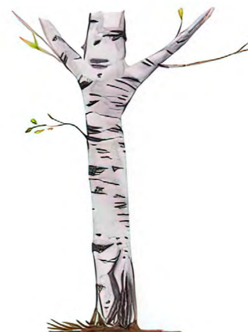
4. Wiigwaas (Weeg-wuas) White Birch