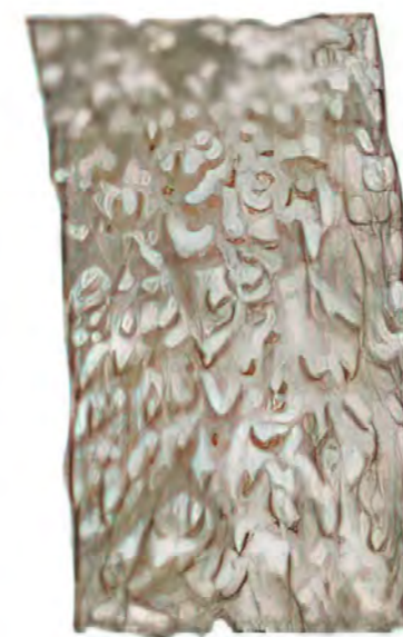
2. Wisigak (We-see-gusk) Black Ash