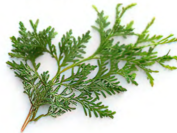
3. Giizhik (Gee-zhe-k) White Cedar